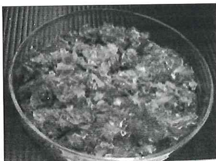
Figure 1. Durian seed gum

The color of durian seed gum were 54.01 \pm 2.56 , 8.70 \pm 1.43 and 22.35 \pm 0.66 for L^* , a^* and b^* , respectively. According to gum from tamarind seed, L^* , a^* and b^* were 52.36 \pm 0.06 , 8.72 \pm 0.02 and 22.19 \pm 0.05 , respectively (Noo-sing and Sompongse, 2015). The color of gum from durian seed was dark brown. According to studies by Noiduang and Phochai (2010), mucilage extraction from okra, by using drying at 60^\circ\text{C} . At high temperature cause polysaccharide breakdown given monosaccharide that can reaction with amino acid from protein breakdown at low temperature, that cause dark green of mucilage okra. The gum from durian seed have characterized to brown sheet and sticky as shown in figure 1.